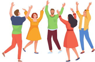
Celebration of Life